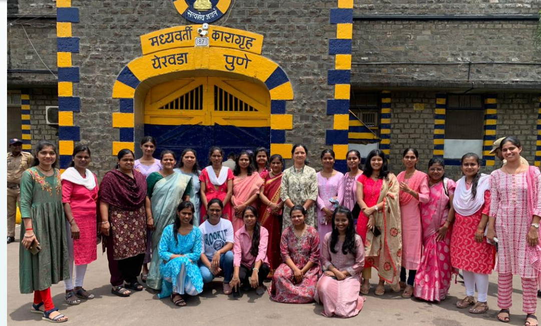
Yerwada Central Jail Visit