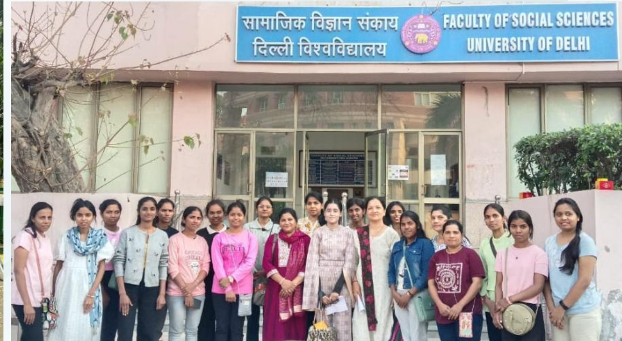
Study Tour 2025 : Kullu - Manali, University of Delhi