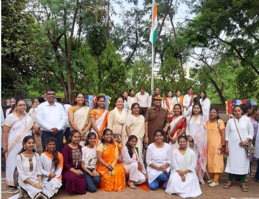
Independence Day Programme