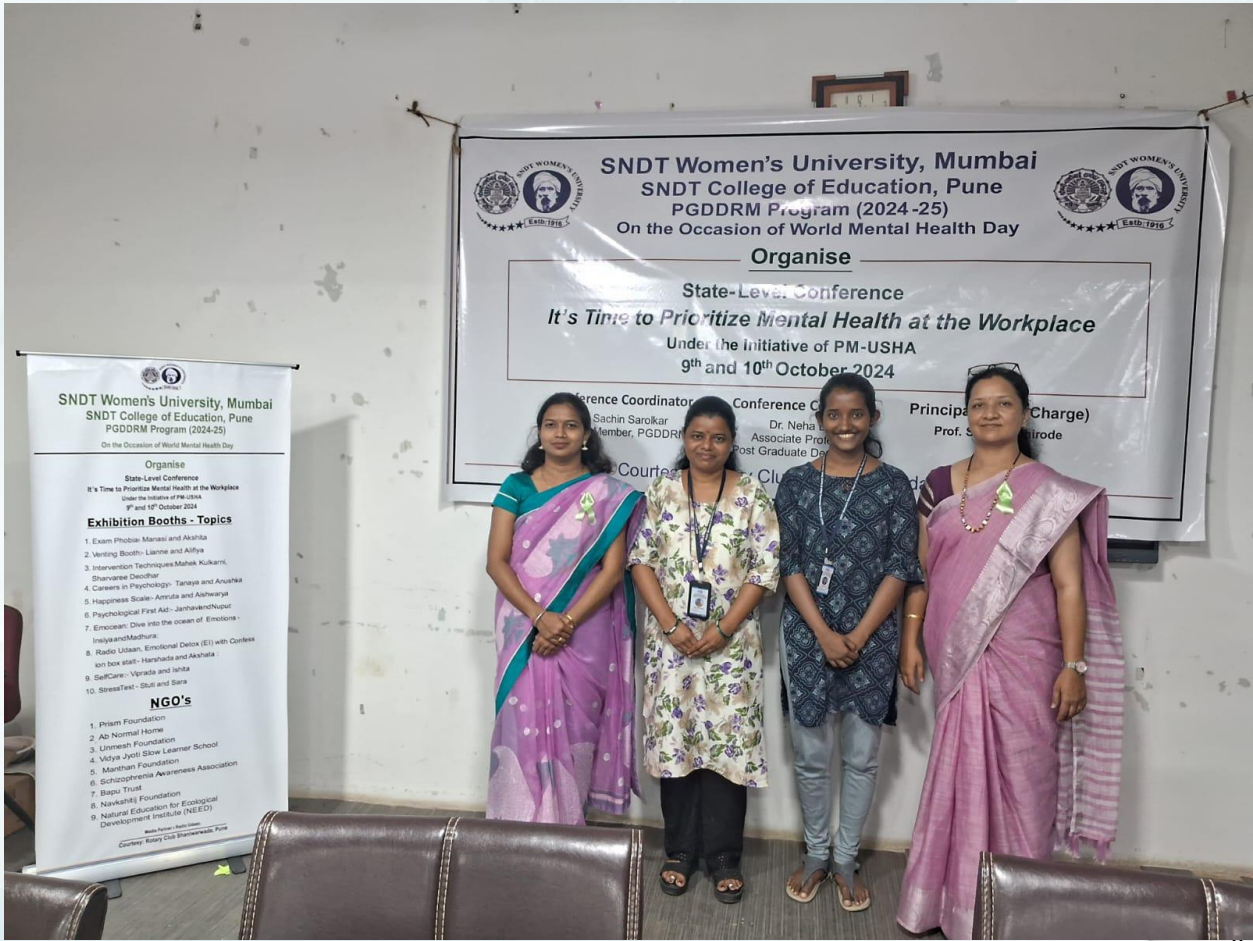
Students Participated in Workshop on Mental Health at Workplace