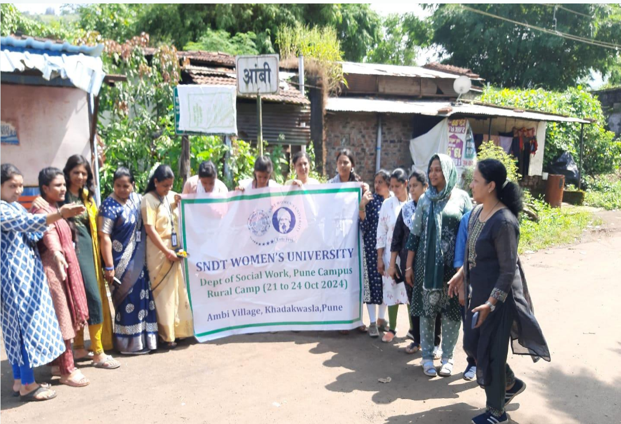
Rural Camp @ Ambi Village