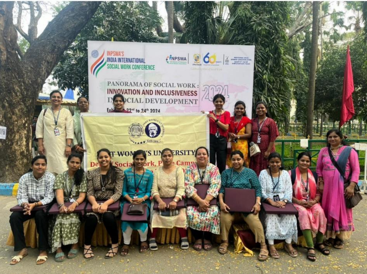
Study Tour 2024 : Kanyakumari, Madurai, Rameshwaram, Dhanushkodi, University of Madras