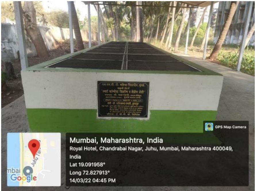
Solid waste management facility at SNDTWU Juhu campus