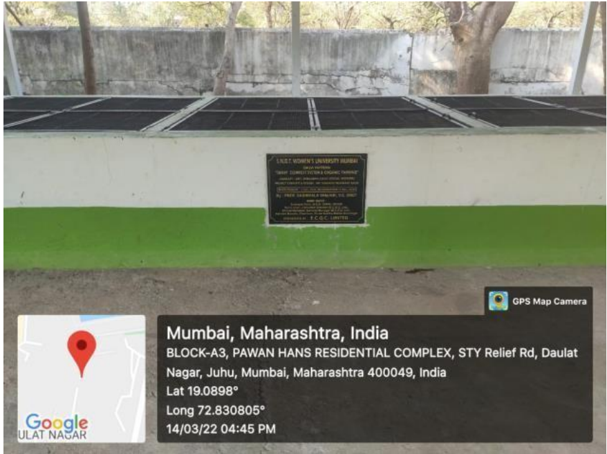
Solid waste recycling system at SNDTWU Juhu campus