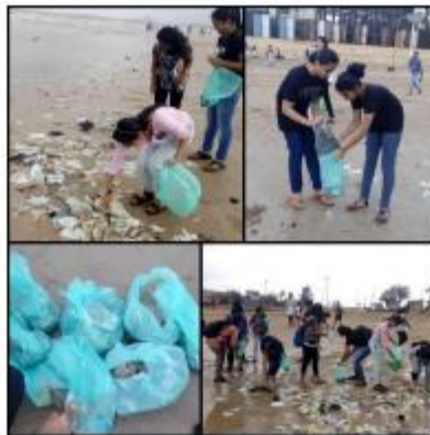
Volunteers while cleaning the beach

The event commenced at 8:00 AM in the morning and the cleaning drive was completed around 11:00 AM. Apart from the cleanliness drive social media awareness was also done to help save the marine life because "We are tied to the ocean. And when we go back to the sea, whether it is to sail or watch – we are going back to where we came from."