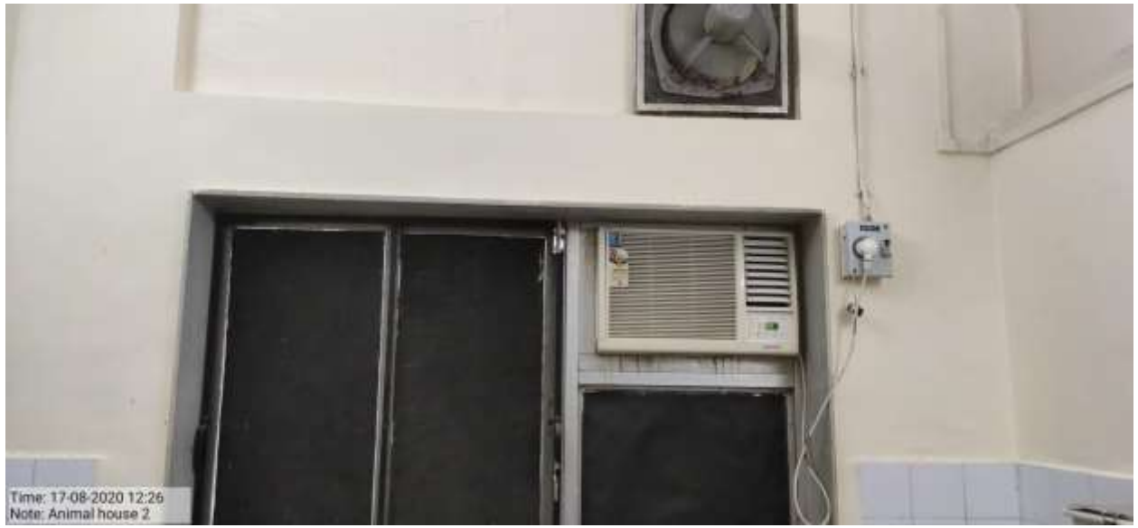
Time: 17-08-2020 12:26 Note: Animal house 2