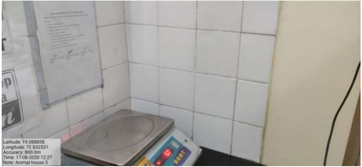
Latitude: 19.088858 Longitude: 72.632531 Accuracy: 800.0m Time: 17-08-2020 12:27 Note: Animal house 3