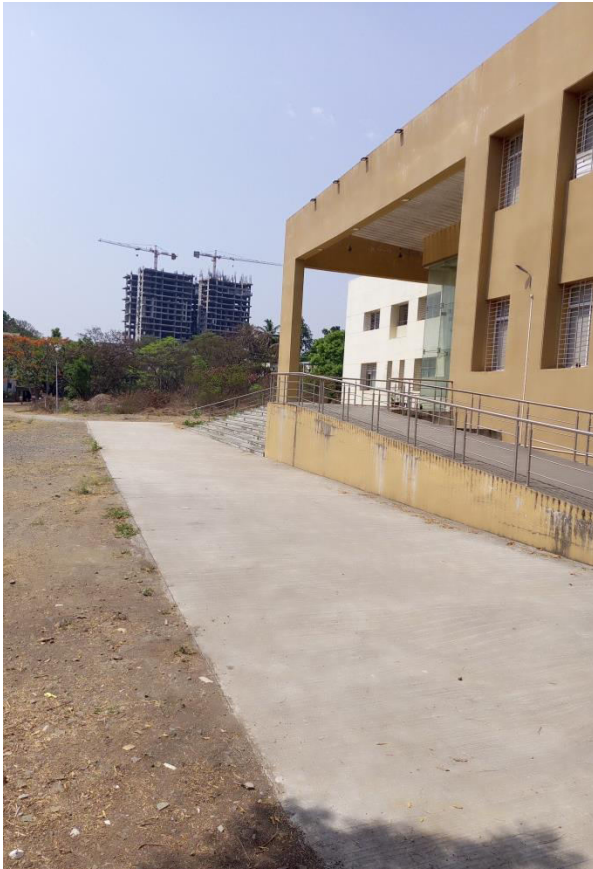
ROAD LEADING TO THE INSTITUTE

All the buildings in the campus are well connected by the roads. All the link road and main roads are asphalted.