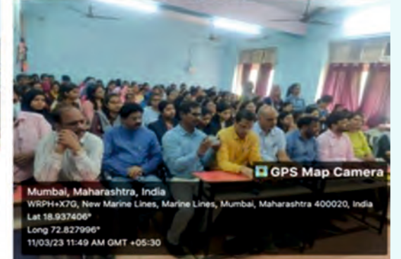
Mumbai, Maharashtra, India WRP11+X70, New Marine Lines, Marine Lines, Mumbai, Maharashtra 400020, India Lat 18.937406° Long 72.827996° 11/03/23 11:49 AM GMT +05:30