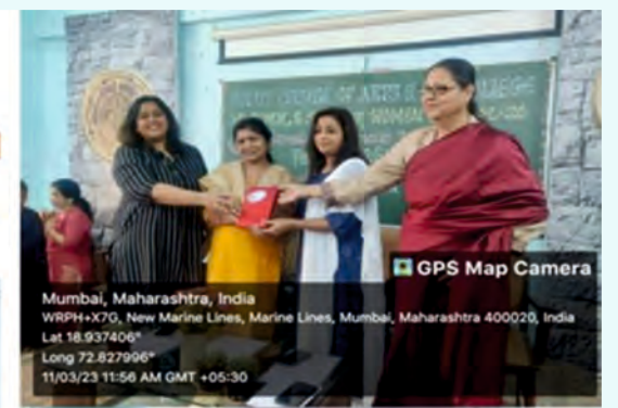
Mumbai, Maharashtra, India WRP11+X70, New Marine Lines, Marine Lines, Mumbai, Maharashtra 400020, India Lat 18.937406° Long 72.827996° 11/03/23 11:56 AM GMT +05:30